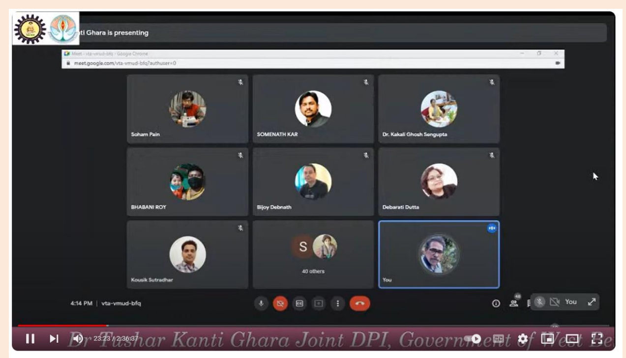
Topic of webinar "One Day Workshop on NAAC First Cycle"